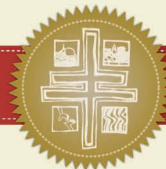
Archbishop of Dubuque

Given this twentieth day of November 2011.